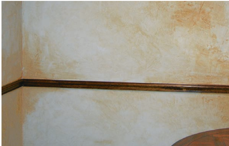
Lightly applying a second color to the surface creates a dimensional quality that gives Tuscan Stucco a dramatic, two-toned effect.