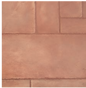
Cut into tile