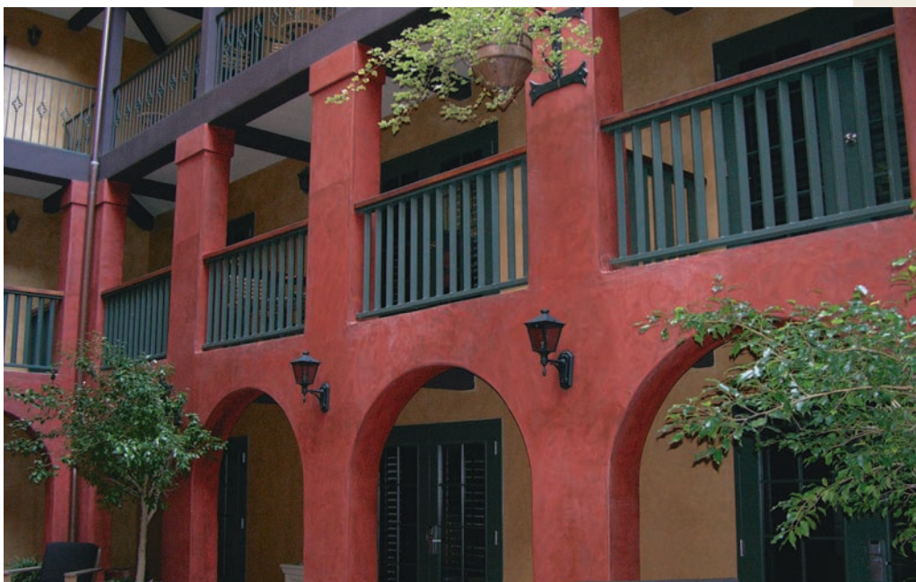
Exterior applications of Aged Limestone clearly demonstrate its dramatic effect.