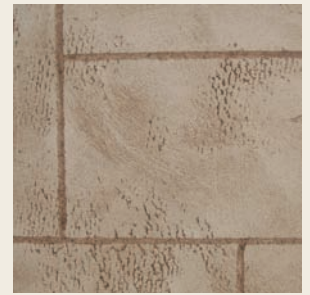
Textured roller, floated, cut into brick pattern