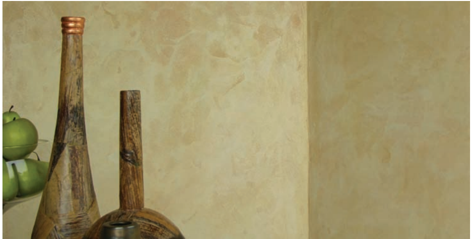
The warmth and beauty of an Old World plaster is easily captured by an Aged Limestone finish.

A unique, polymer-modified, cement-based coating, LaHabra's Aged Limestone makes it easy to achieve a durable, dramatic finish for interior and exterior walls. Duplicating the look and feel of real stone and European cement plasters, it offers the ultimate combination of design flexibility, ease of application and outstanding product performance.