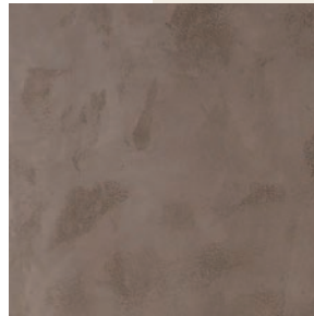
Textured roller, floated